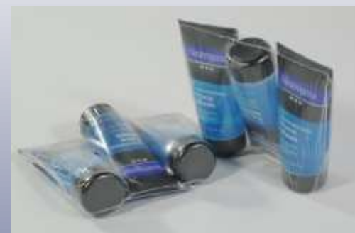
Automatic systems for cartons, bottles, and tubes available