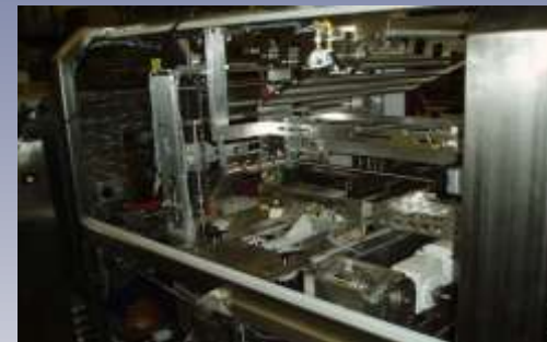
Collation and pusher area Fully adjustable