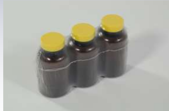
Different shapes and sizes of your products can be packaged on our equipment. Loose and supported products are also possible.

Fully automatic systems for tapered tubes