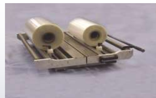
Easy load film racks